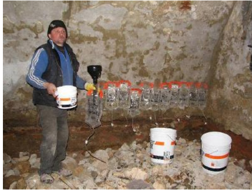
Figure 6: Introducing DryKit bicomponent formula into the wall