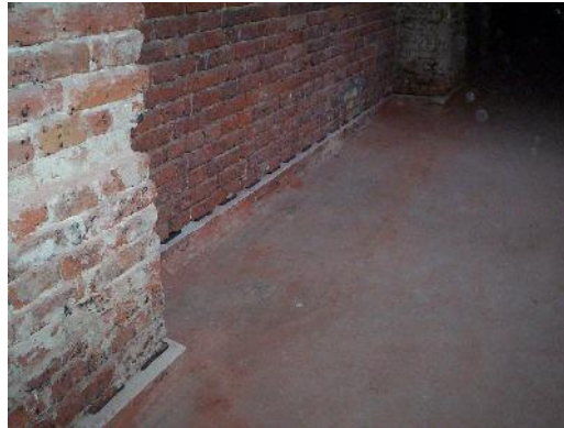
Figure 6: Introducing DryKit bicomponent formula into the wall

At Karolyi castle, interventions aims to correct the problems of strength and stability, removing moisture from the capillary walls, cleaning basements, exterior and interior plaster, roof restoration, decorative items, etc. Related to drying up measures for building walls, Comer method was used based on its high rate of success. Work began in late 2009 and the implementation of insulating sheets along with anchoring wedges is according to figure 7.