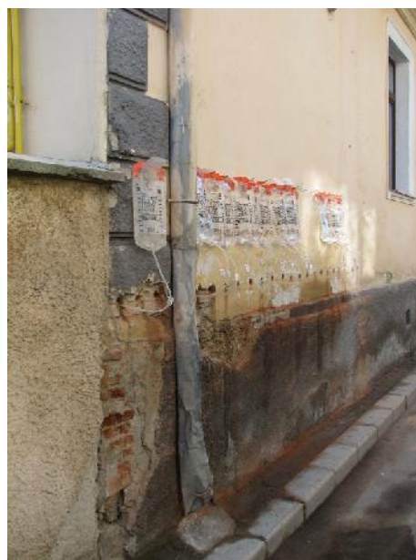
Figure 5: Applying DryKit technology to an exterior wall

At the „Ilie Birt” memorial house from Brasov [6], DryKit system was also applied for creating the horizontal chemical barrier into the walls. Some images that illustrate this technology and its way to applied at exterior and interior walls are presented in figure 5 and figure 6.