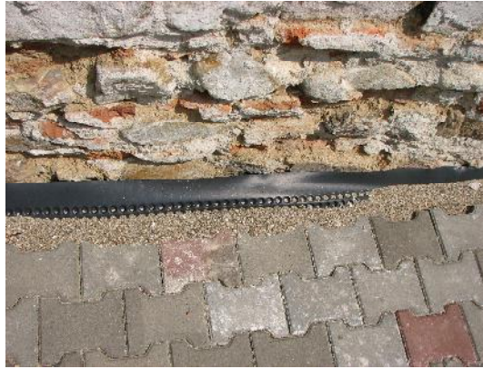
Figure 3: Using Tefond high-density polyethylene sheet to ventilate foundations

mentioned above in the article. Were also executed works in order to eliminate the floor effect and to ventilate foundations both interior and exterior side of the church. Few images after implementing specific measures are presented below (fig. 3; fig. 4).