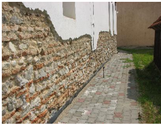
Figure 4: Positive effect to the wall, after applying DryKit technology