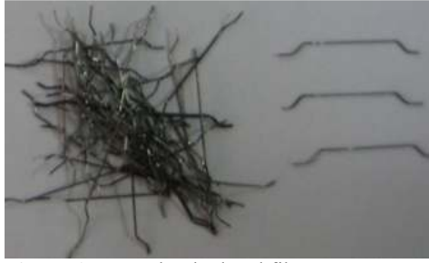
Figure 1: Long hooked and fibers