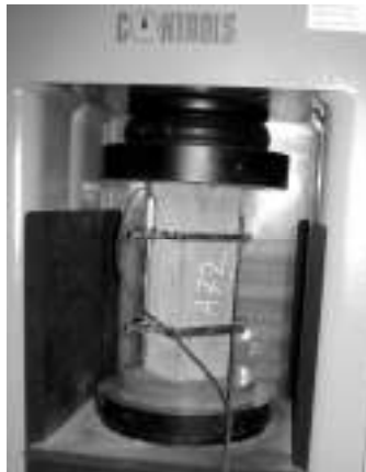
Figure 3: Elastic modulus setup

The elastic modulus was tested using 100x100x300mm prismatic specimens as secant modulus. The tested specimens were loaded at stress levels of 0.4 f_c (compressive strength). The compressive strength ( f_c ) was previously tested on same type specimens (100x100x300mm prism). The loading-unloading cycles were performed with a speed of 2 MPa/s. This relatively large speed is necessary having in mind the ultra-high strengths of this concretes, which can exceed 150 MPa. A general view of a specimen setup for elastic modulus determination is displayed in Figure 3.