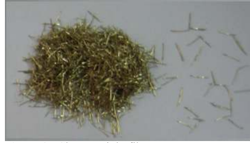
Figure 2: Short straight fibers

From the reinforcement point of view three types of concrete were used for the determination of hard concrete properties: (a) non-reinforced concrete (UHPC); (b) 2.55 Vol.% long fiber reinforced concrete (UHPFRC-L); (c) 2.55 Vol.% hybrid reinforced concrete (50% short fibers+50% long fibers) (UHPFRC-H). The concrete was produced using a 85 l mixer. After mixing the concrete was cast and the specimens were covered with a thin oil film to prevent evaporation. The specimen were demolded after 24 hours and subsequently were subject to steam curing regime ( 80% RH, 90C) for 6 days.