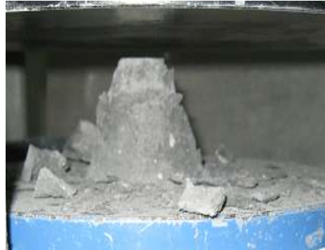
Figure 7: UHPC failure