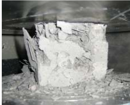
Figure 6: UHPFRC-H failure

The concrete reinforced with long fibers (UHPFRC-L) exhibited a similar behavior to that of hybrid reinforced concrete (UHPFRC-H), therefore the stress-strain curves in compression are displayed only for UHPFRC-H and UHPC (Figure 5). The non-reinforced concrete (UHPC) and the fiber reinforced concrete (UHPFRC-H) behaved in linear-elastic manner almost until the maximum stress was reached. Afterwards, the fiber reinforced concrete displayed a ductile behavior with large deformation in contrast with non-reinforced concrete which exhibited a brittle behavior with a sudden failure. A general aspect of the two types of failure is displayed in Figure 6 for the fiber reinforced concrete and in Figure 7 for non-reinforced concrete.