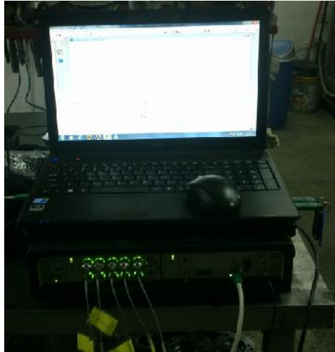
Figure 1. Acquisition platform and channel set up

In order to have a sufficient precision of the measurements there were used 6 accelerometers mounted on the turbocharger in the following order: