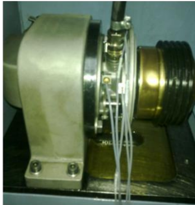
Figure 2. Accelerometer montage on to the GTV 2260 V turbocharger

The placement of the accelerometers on the GTV 2260V turbocharger is presented in figure 2.