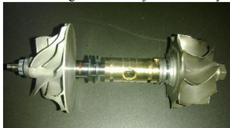
Figure 3a. Turbocharger rotor sustained by hydrodynamic bearing

The two turbocharger rotors subjected to study are presented in figure 3 a and b.