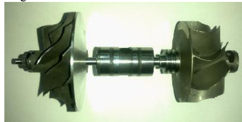
Figure 3b. Turbocharger rotor sustained by rolling bearing