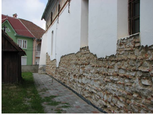
Fig. 6 Exterior wall waterproofed and ventilated foundation.

More suggestive images are presented as follow: