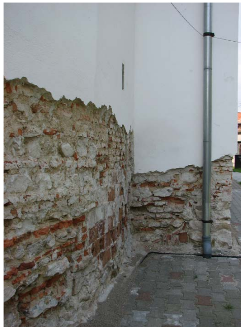
Fig. 5 Collection and disposal of rainwater.

The technical specification was followed exactly and the results can be observed bellow: