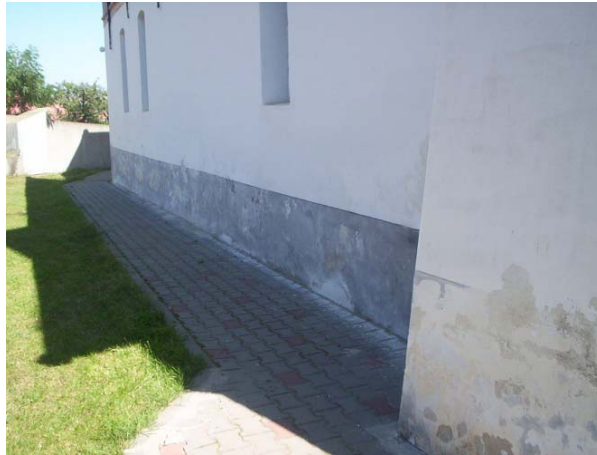
Fig. 3 Capillary moisture and efflorescence on exterior wall.