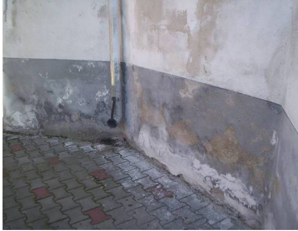
Fig. 2 Capillary moisture on exterior wall.

Some suggestive images are presented below: