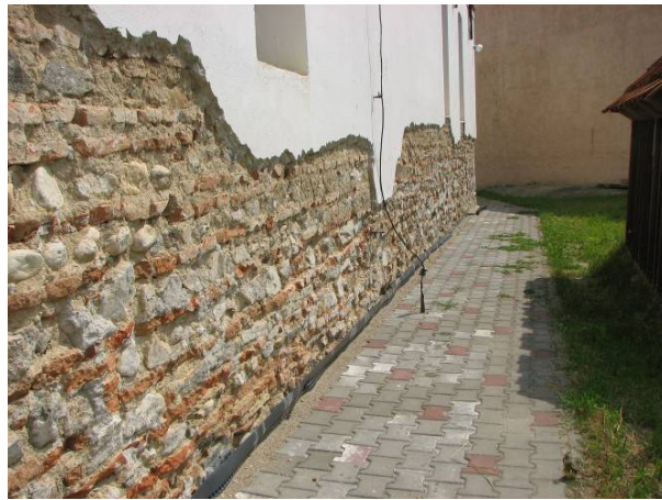
Fig. 7 Positive effect after applying DryKit method as described above.