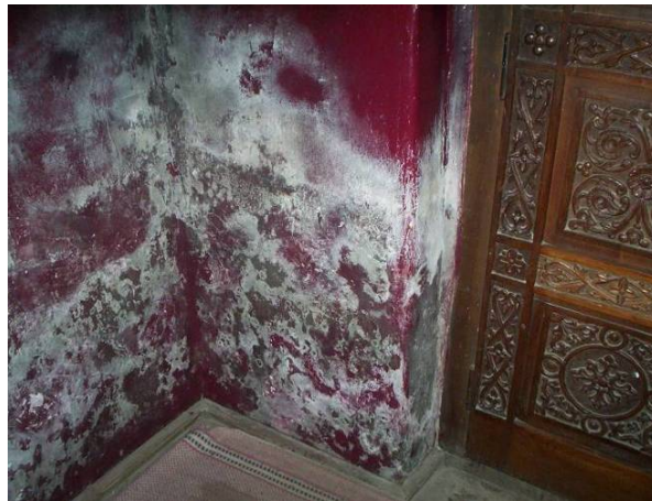
Fig. 4 Efflorescence and damaged paintings on interior wall.