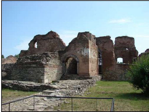
Fig.8 – Târgovişte princely court buildings Walls (Ghizmo)