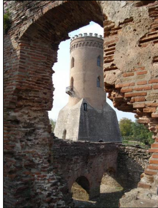
Fig. 2 – Chindia Tower

The mortar samples, taken as holesaw from the "situ" was prepared for analises, first, by disaggregation, for component separation. For this purpose we used thermal decomposition method, used for the first time by prof. dr. Serban Solacolu