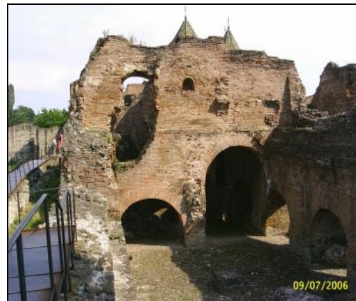
Fig.1 – Targoviste – whales of princely court buildings

stabilised, at the quite near levels, perfect horizontal plans, wich can stabilized the stone masonry; boulders, having unregulry forms, the masonry is exposed at unequal subsiding, able to bring cracks.