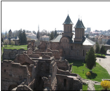
Fig.4 – Buildings from Petru Cercel historical period

Given the above, it can be said that mortars belonging to the most recent historical period - 1584, Petru age composition Earring are optimized in the sense of granularity unit. This feature is reflected in the quality of the mortar, the lower porosity (27% versus 32 ÷ 37%) and higher density (1.8 versus 1.5 ÷ 1.64), which corresponds to better sustainability.