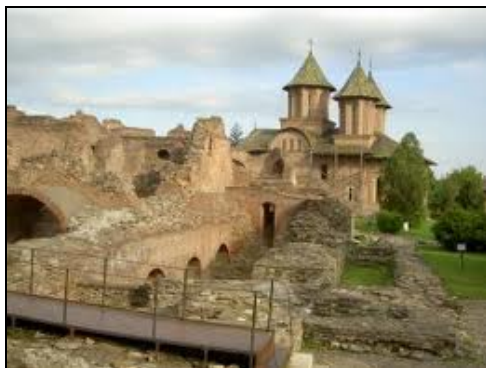
Fig.5 – Stone and brick walls in Târgoviște princely court (Ghizmo)