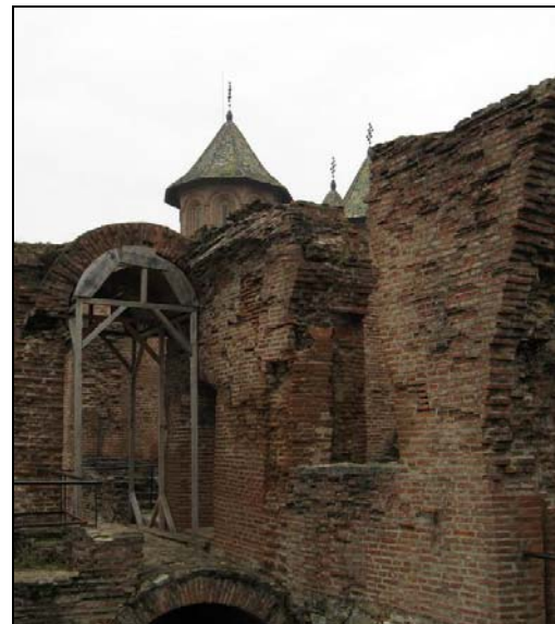
Fig.7 – Târgoviște Walls (Ghizmo)