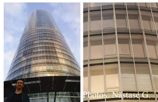
Fig. 14. Overview of Business Tower Nuremberg, Germany (left) and double-skin facade detail (right).

The tower is equipped with double glass façade, allowing its natural ventilation, at every level, despite its height and it was no longer necessary to install an air conditioning system, thereby achieving maximum economic and environmental efficiency.