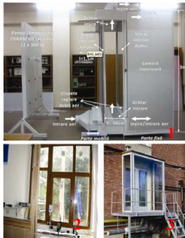
Fig. 3. All three experiment of double-skin façade in Romania

Now it's in development the third experiment for a PhD thesis in Braşov, at Building Services Faculty from Transilvania University of Braşov.