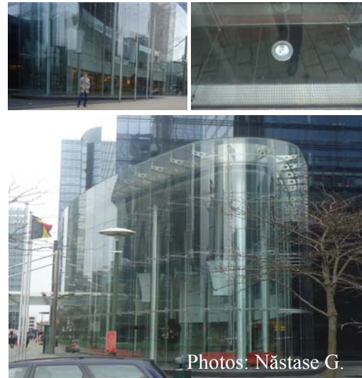
Fig. 8. Detail and overall double-skin façade from North Galaxy Towers entrance, Brussels, Belgium

North Galaxy Towers , located on the Boulevard Roi Albert II, Brussels, Belgium have 28 levels each with two technical levels on top of each. The building is accessible through a majestic entrance, which is elliptical, with a double glass façade as a key feature. The windows are 13 m in height and hangs by tensioned cables using a steel structure from the roof to below ground floor.