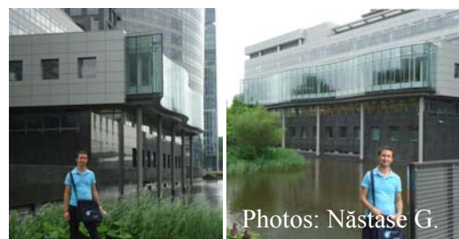
Fig. 9. Views of double-skin façade, headquarters of ABN AMRO Bank, Amsterdam, Netherlands

The building is one of the top 10 tallest buildings in Amsterdam, with a height of 105 m and 24 floors.