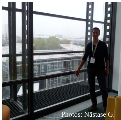
Fig. 13. Photo from inside the double glass façade of NCC building from Nürnberg Messe complex and view of floor heating unit.

NCC building from Nürnberg Messe is built with double-skin façade that allows natural light into a very high proportion, thus providing an open and communicative atmosphere, thus achieving optimal conditions for events for which it was made construction, but is also energy saving.