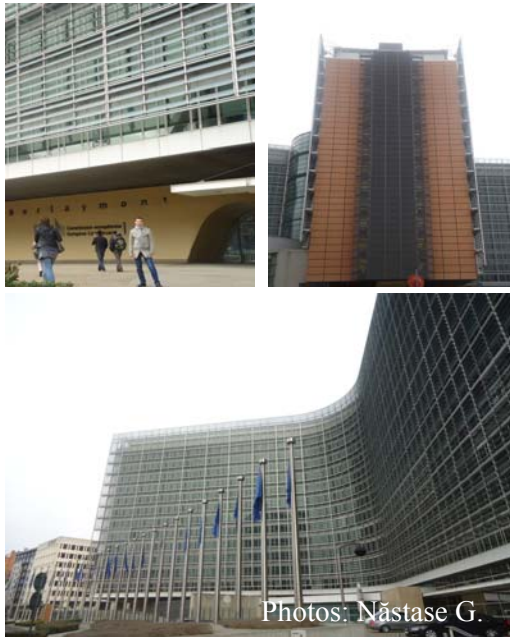
Fig. 3. Front view, side view and overall view, Berlaymont Building, Brussels, Belgium

The architects Pierre Lallemand, Steven Beckers and Wilfried Van Campenhout conducted renovation during 1991-2004.