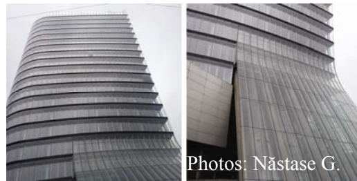
Fig. 12. UNIQA tower's double skin façade, Vienna, Austria