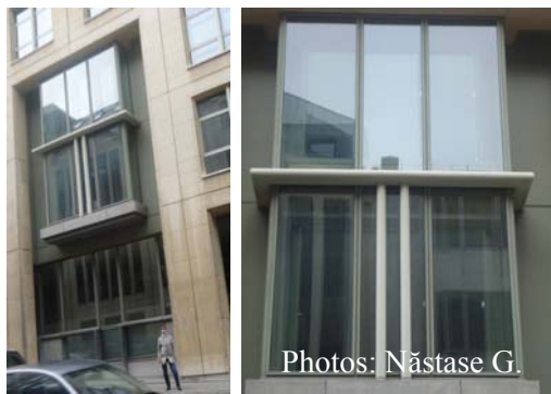
Fig. 6. Double-skin façade, “box” type (southwest cardinal direction), DVV extension building, Brussels, Belgium

cavity, which runs through and returns to the bottom of the HVAC system. Air can be recirculated or can be exhausted.