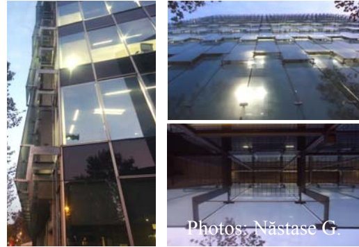
Fig. 2. Side view, front view and under the cavity, Interface Building, Barcelona, Spain

The outside glasses on this façade are disposed upward, as can be seen in Figure 2, to create a beautiful architectural effect, and at every level in the cavity is a metallic platform to pass by.