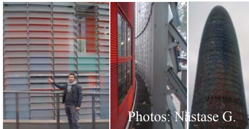
Fig.1. Exterior façade, the inner cavity and overview of Torre Agbar, Barceloan, Spain

Arquitectos, headed by Fermin Vázquez, is the headquarter of Agua de Barcelona , has 35 floors and an overall height of 142 meters. The building is located in Barcelona, next to Plaça de les Glòries, between Avingua Diagonal and Carrer Badajos. This building's double skin façade consist of an inner concrete façade, upon were mounted boards painted in red, blue, green and grey, with integrated windows in the wall's structure and an exterior façade made of laminated glass modules, anchored by a steel structure on the interior concrete façade.