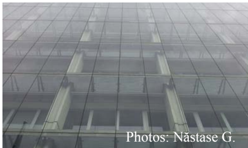
Fig. 10. Front view of IBM building's double skin façade, Vienna, Austria

In Austria, Vienna has been viewed IBM building , located at Obere Donnaustraße 95, near the Danube Canal, which was built in 1969 and restored by architect Rudolf Prohazka in 1999-2001. Renovation of existing front consisted of mounting of a double glass façade, covering an area of 1000 m 2 , to reduce energy consumption for cooling and heating. Outer envelope is slightly curved outward, as can be seen in the picture below.