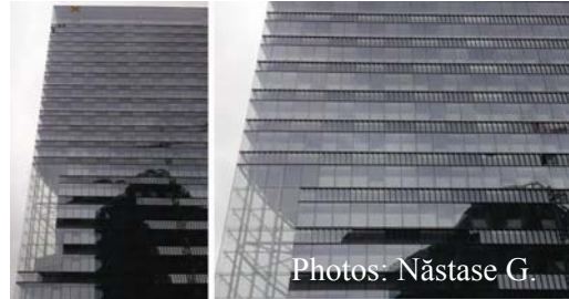
Fig. 11. Double-skin façade of Raiffeisen Bank in Vienna, Austria

In the same area, just near IBM is building a Raiffeisen Bank with double glass façade that allows good natural ventilation of the building. Construction is almost complete and is intended to be a reference building in resource conservation, energy efficiency and environmental protection. Flagship office building was designed by architects Dieter Hayde, Ernst Maurer and Radovan Tajder and is modeled after the concept of "Raiffeisen Klimaschutz-Initiative" (Raiffeisen climate protection initiative).