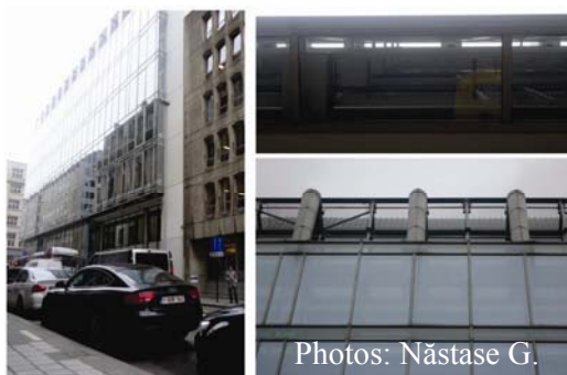
Fig. 4. Double-skin façade on Brussimo building, Brussels, Belgium

The building comprises a ground floor with reception area, a first floor with meeting offices and waiting areas, five floors with standard offices and level seven, which is half semi-cylindrical shape, which serves as a technical space.