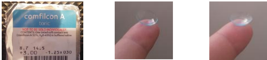
Figure 3. Dehydration of the monthly replacement contact lens with continuous wear

In this case, time of dehydrating for the lens was about 16 hours, which shows that the lens may be worn overnight and up to about 24 hours. It is recommended that after this period, at least 2-3 hours to be hydrated in particular maintenance solution.