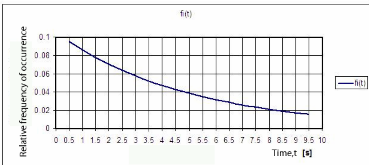
Figure 1: Graphical representation of the distribution of intervals between vehicles (5)

The microscopic analysis of traffic flows consist to calculate probabilities for each of the intervals between the vehicles using the equation (2.83), taking into account different values of real time interval, t, followed by the registration table (Table 1 and Table 2) and (Figure 1).