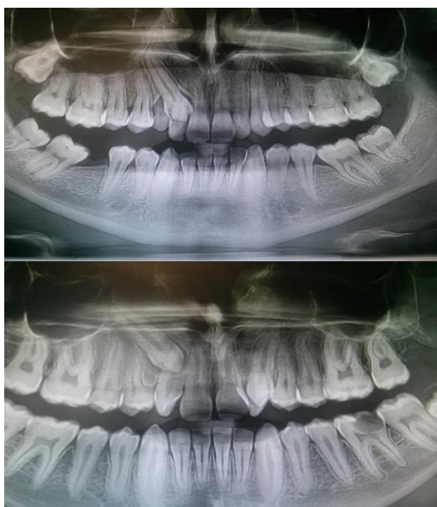
Fig.2- Examples of panoramic X-rays used for canine impaction screening