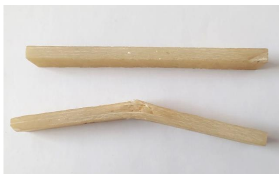
Figure 1: 6 mm thick samples before and after tests

The considered material in this case is fiberglass.