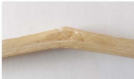
Figure 4: 6 mm thick samples and after tests. Breakage in the middle section.

The specimens were made of polyester resin reinforced with several layers of RT 800 glass fiber fabric failed in the mid-zone during the tests.