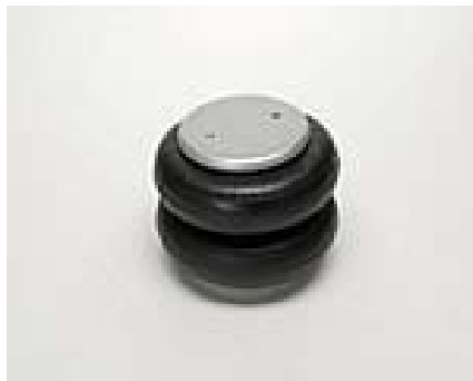
Fig. 5. The circumvolute air springs