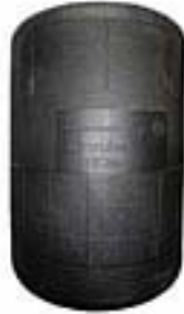
Fig. 3. The air springs without membrane