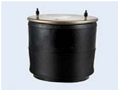
Fig. 4. The pneumatic spring diaphragm with metal plate