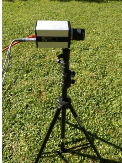
Figure 1: AOS high speed camera

Motion capture was done with AOS high speed camera (Figure 1), type X-PRI color, operating at a frequency of 500 fields/sec. Video camera was placed in the side view perpendicular to the runway, at a distance of 10 m from the take-off board, recorded the jumps in the frontal plane. A global reference frame was defined with the x axis parallel to the runway and the y axis was vertical. Each athlete had markers attached to the main joints: knee, ankle, hip, elbow, shoulder.