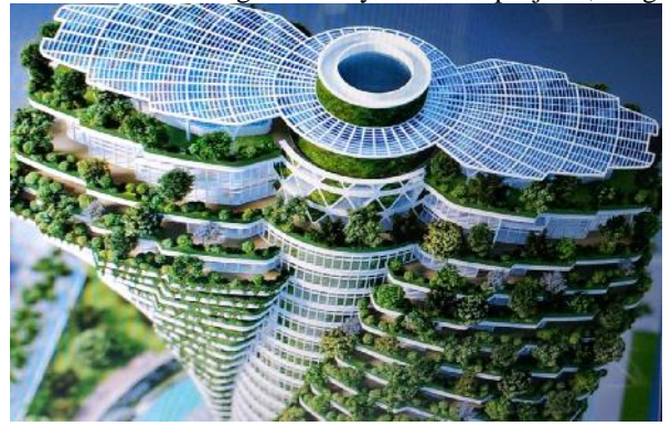
Fig. 5: Project futuristic building "eco" [13].

Worldwide have imagined many futuristic projects, a significant example is shown in Figure 5. [13].