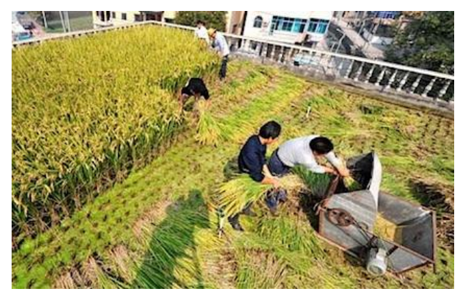
Fig. 3. The roof ecological St. Luke's International Hospital, Akashi, Japan [11]