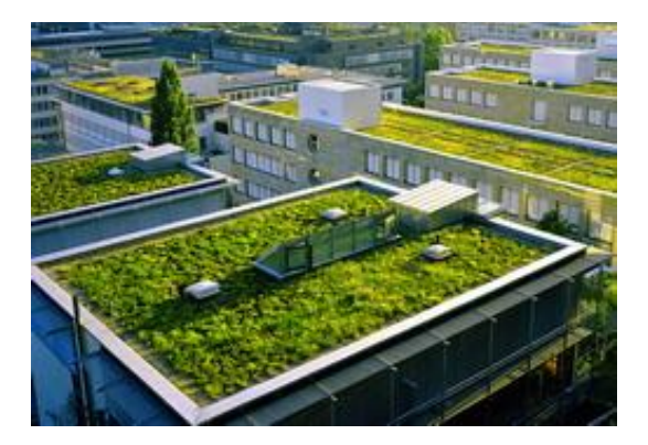
Fig. 1. Green roofs of blocks of Bucharestproject [6]