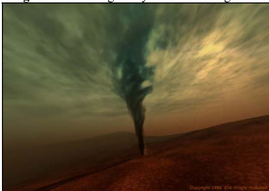
Figure 7: Singularity that forms a cyclone ( https://eng.hebus.com/# )