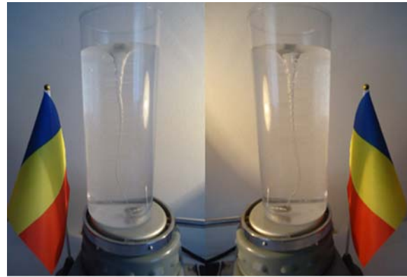
Figure 12: When singularity moves, pulls the tornado tip after it