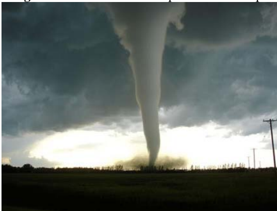
Figure 3: At the beginning there is a rotation point motion on ground