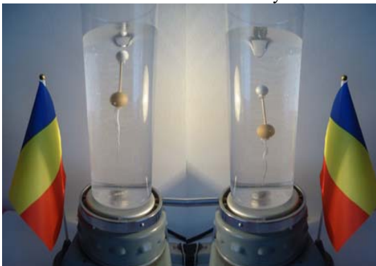
Figure 15: Stopping tornado using two spheres linked together. 78% efficiency