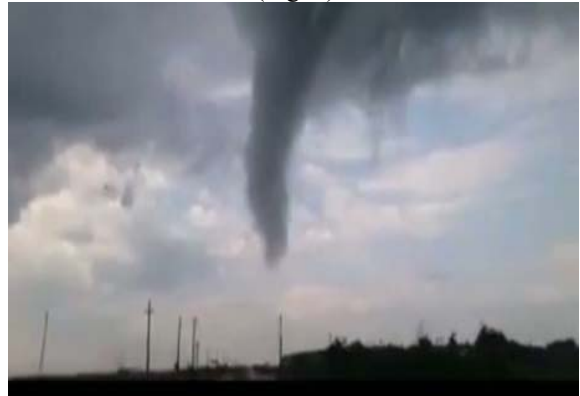
Figure 2: Swirl that rotates with high speed