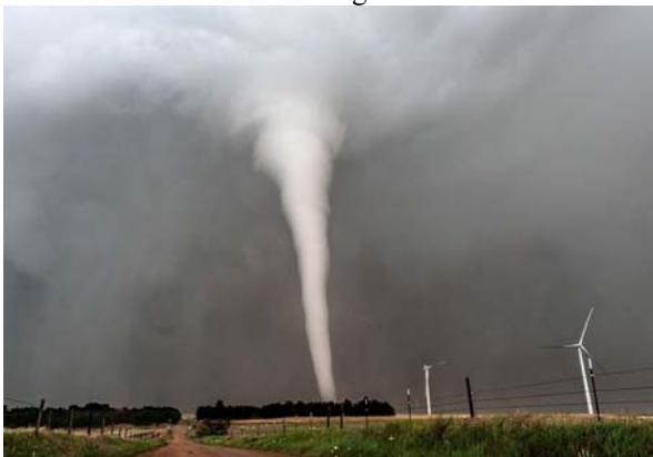
Figure 5: The singularity moves on the ground