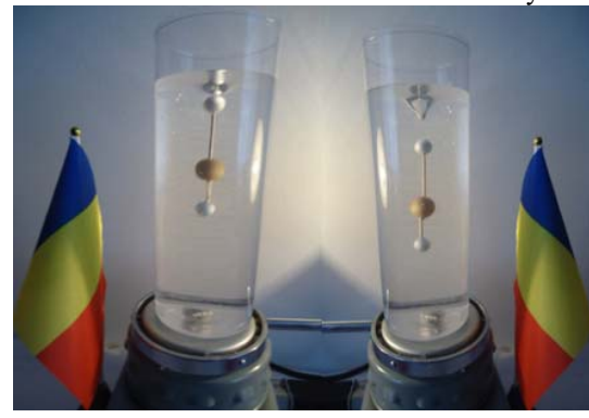
Figure 16: Stopping tornado using three spheres linked together. 80% efficiency