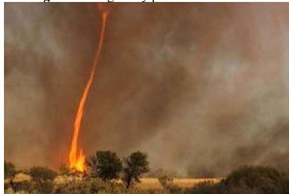
Figure 8: Singularity can form a fire tornado