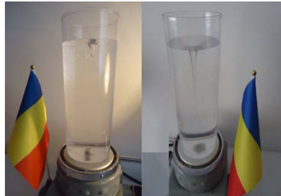
Figure 10: Rotational magnetic field with 2500 rotations/minute forms a tornado from water surface