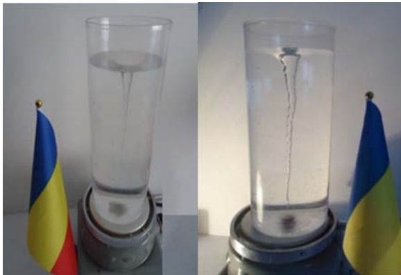
Figure 11: Tornado that grows upside down due to the rotation of singularity (magnet)