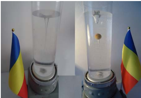
Figure 13: Stopping tornado using a sphere of 30 mm diameter. 75% efficiency.

It can be noticed that if the singularity moves, the tip of tornado follows singularity as in nature (Fig. 21). Tornado behaves like a black hole. The black hole swallows all the matter that lies near it.