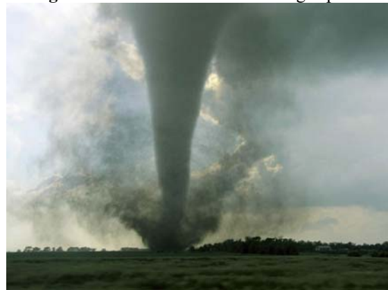
Figure 4: The singularity (very small black hole) at the top of tornado