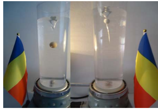
Figure 14: Stopping tornado using spheres with different densities. 65% - 75% efficiency