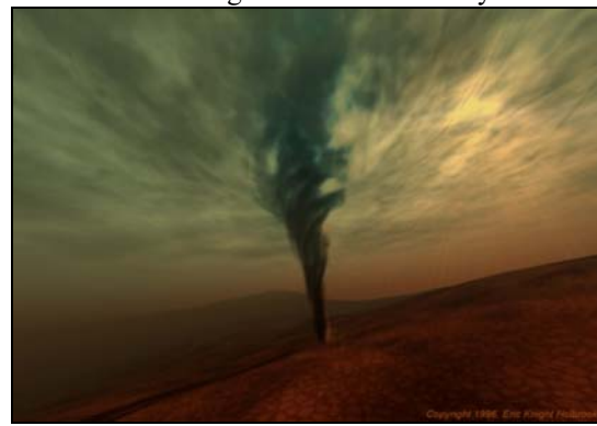
Figure 18: Singularity curves space like a cyclone.