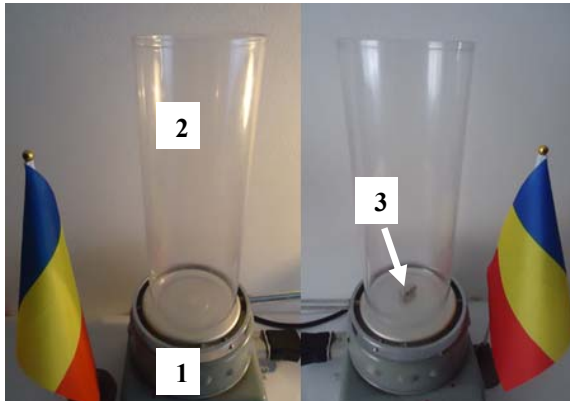
Figure 9: The experimental set-up

For the formation of a tornado we need: a stirrer (1), a high glass (2) and a cylindrical magnet (3) as singularity (very small black hole, see Fig. 9). Fill the high glass (2) with 80% water of its height, as shown in Fig. 10. Start the stirrer (1) from the start button, which rotates the magnet (3) at 2500 rotations per minute. We notice how the tornado slowly begins to form from the water surface to the base of the glass. We notice how the tornado grows upside down (Fig. 11), like an icicle, due to the rotation of the singularity (magnet). If the glass moves on the surface of the agitator, the tornado tip does not leave the singularity, so the tornado cone curves. On the ground, singularity moves and pulls the tip of the tornado after it (Fig. 12). The force that causes the tornado is: F = m \cdot a , where m is the mass and a represents the acceleration. But: a = v^2/r , so F = mv^2/r . For tornadoes caused by singularities, m < 1 \text{ kg} , r < 1 \text{ m} , v < 1 \text{ m/s} , so F = 1 \cdot 1^2/1 = 1 \text{ kgm/s}^2 . The singularity with force F = 1 \text{ kgm/s}^2 cannot form a tornado. Conclusion: at low speeds, tornadoes cannot form singularities.