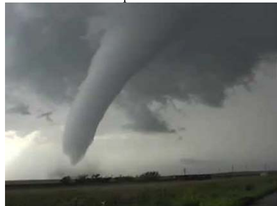
Figure 6: Singularity pulls tonado after it