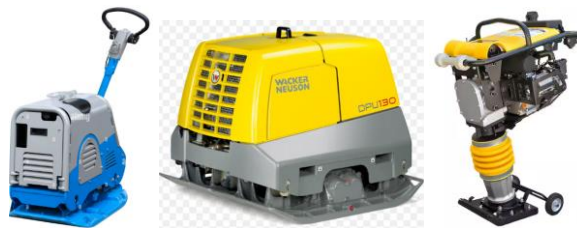
Figure 1: New material used to protective housing of the compactors equipment [13-15]

life of the technological compaction equipment), as well as the comfort of the attendant operator. The use of fiberglass or carbon fiber composite materials in the engine housing provides greater corrosion resistance in harsh working environments and helps reduce overall weight. Also, the control lever and handles are easier to handle and more comfortable for the operator, if they are made of fiber-reinforced plastic composite materials, offering an ergonomic design, increased resistance to wear and tough working conditions. The joining parts and supports in the structure of the equipment that ensure the connection and support of the various components of the vibratory compaction equipment are also made of composite materials with carbon fiber or glass, thus offering increased resistance to traction and bending, being ideal for parts that must be at the same time light and durable. Thus, the engine impact protection housing is made of a single piece made of high strength composite material (Figure 1).