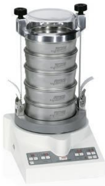
Figure 1: The device used for the sieve analysis, type Makarov [10, 7]

The device used for the sieve analysis is the device Makarov (Fig. 1) provided with a predetermined number of planar sieves. [10, 7]