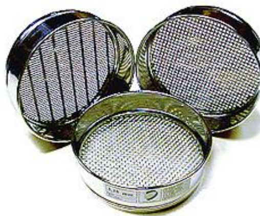
Figure 2: Tyler sieves [10]

By sieving the material are obtained several classes of products, the differences are depending on the mesh size sieve. The sieve with the largest holes is positioned first; the next sieves are positioned in the following descending order of mesh sieve. The last area, called blind sieve is a surface without holes, and on it are collected the sifting from the last sieve. During sifting the material remaining on the sieve is called refuse, and the material passing through the mesh is called sieving.