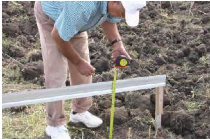
Fig. 3. Appearance during h1 ordinate determination