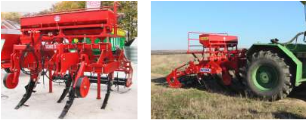
Fig. 1. DECOM-FERTI machinery

DECOM-FERTI machinery consists of the following major assemblies: chassis, active reversible organs with chisel knives and special knives to remove the hardpan; working depth adjustment wheel; fertilizer equipment for heavy soluble nutrients.