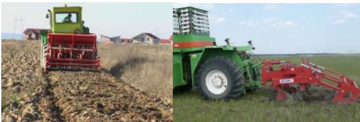
Fig. 2. Machinery DECOM-FERTI and Technical Equipment DECOM in aggregate with tractor ZIMBRU

The main quality indicator of work at the work of arable soil in substrate is the degree of raising of soil . The degree of raising of soil was determined by measuring the coordinates of various points from a reference system (Fig. 3), consisting of a ruler above the field over two pales. Ruler was placed horizontally by mean of an air bubble level and was oriented perpendicular to the direction of advance of the machine.